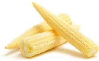
BABY CORN 5 LB