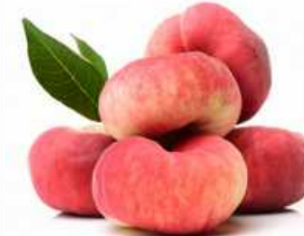
DONUT PEACHES 8 LB