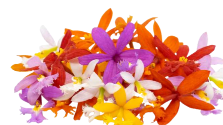
RAINBOW ORCHIDS 100 CT