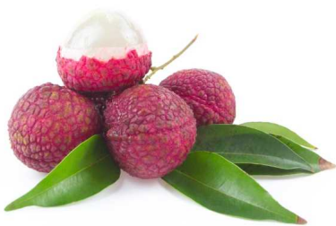
LYCHEE 10 LB