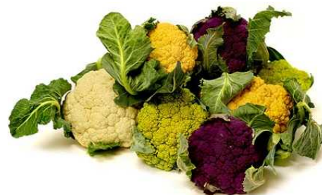
MIXED CAULIFLOWER 6 CT