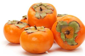
FUYU PERSIMMONS 18 CT