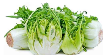
PUNTARELLA 15 LB (12CT)