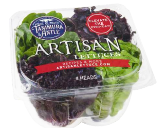
ARTISAN LETTUCE 12 CT