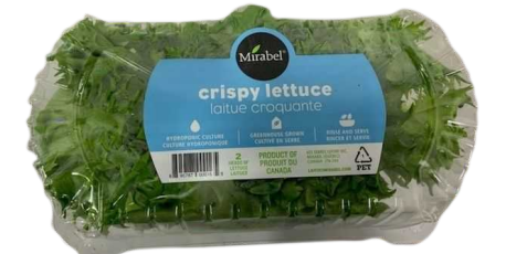
CRISPY CRUNCHY LETTUCE 16 HEADS