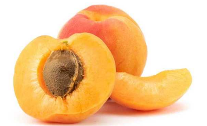
APRICOTS 18 LB