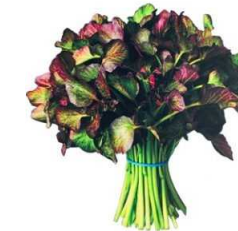
RED WATERCRESS 1.5 LB