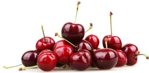
CHERRIES 11/12 16 LB