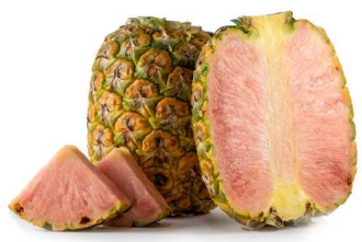
PINK PINEAPPLE 2 CT