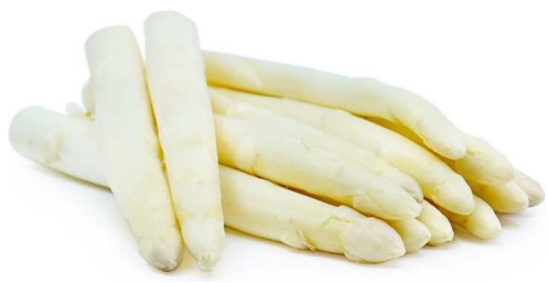
WHITE ASPARAGUS 11 LB