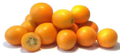
KUMQUAT 10 LB