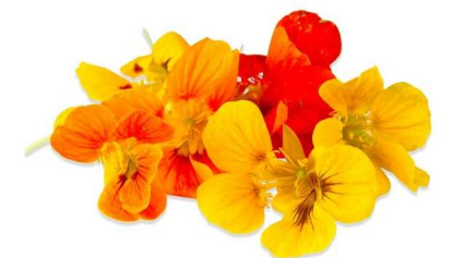
NASTURTIUM FLOWERS 50 CT