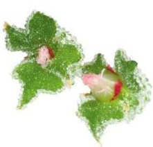
BLINQ BLOSSOM 50 CT