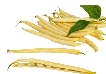
YELLOW WAX BEANS 10 LB