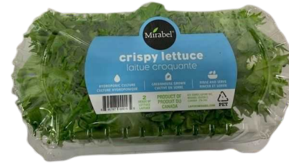
CRISPY LETTUCE 16 CT