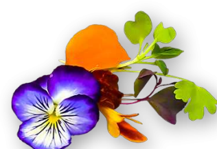
MICRO CELEBRATION MIX