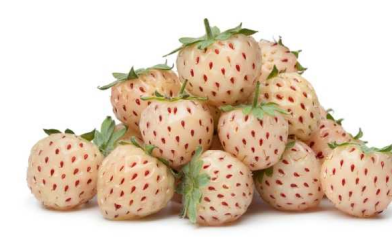
PINEBERRIES 8 PACK