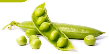
ENGLISH PEAS 10 LB