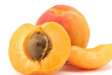
APRICOTS 18 LB