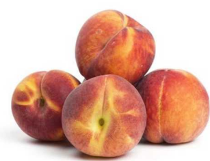
TRAY PACK PEACHES 18 LB