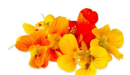
NASTURTIUM FLOWERS 50 CT