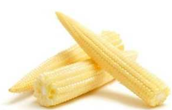
BABY CORN 5 LB