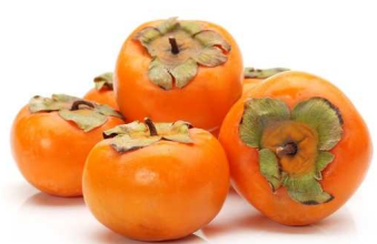
FUYU PERSIMMONS 18 CT