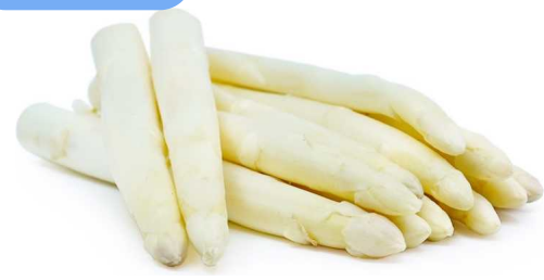
XXL WHITE ASPARAGUS 11 LB