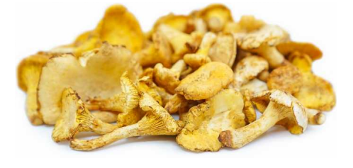
YELLOW FOOT CHANTERELLE 1 LB