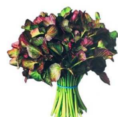
RED WATERCRESS 1.5 LB