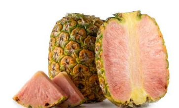
PINK PINEAPPLE 2 CT