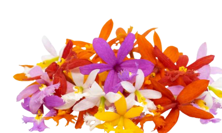
RAINBOW ORCHIDS 100 CT