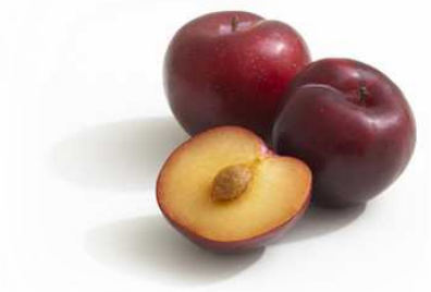
BLACK PLUMS 28 LB