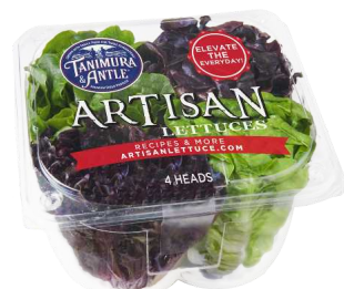
ARTISAN LETTUCE 12 CT