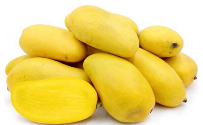
ATAULFO / CHAMPAGNE MANGO 8/18 CT