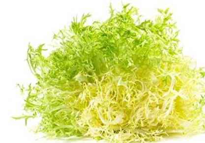
FRISEE MASTER CASE 10/12 CT