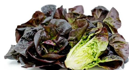
RED LITTLE GEM LETTUCE 24 CT