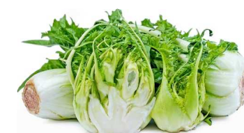
PUNTARELLA 15 LB (12CT)