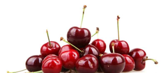
CHERRIES 11/12 16 LB