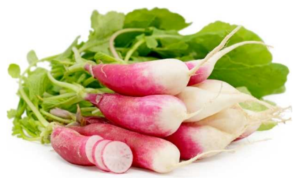
EASTER EGG & FRENCH BREAKFAST RADISHES