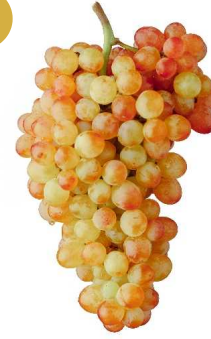
PINK MUSCAT GRAPES 16 LB