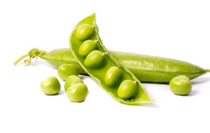
ENGLISH PEAS 25 LB