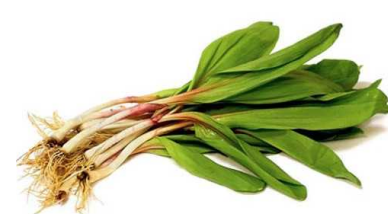
LOCAL RAMPS 1 LB