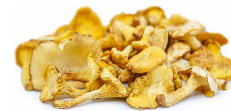
CHANTERELLE MUSHROOM 1 LB