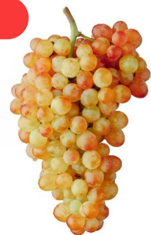
PINK MUSCAT GRAPES 16 LB