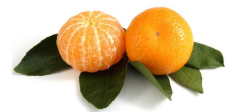
ORANGES MANDARIN 20 LB