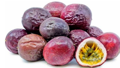
PASSION FRUIT 5 LB