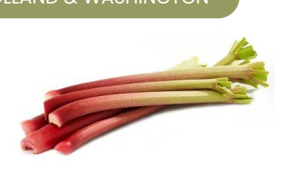
RHUBARB 10 LB