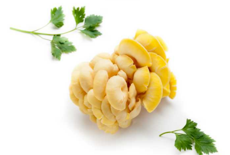
GOLDEN OYSTER MUSHROOM 3 LB