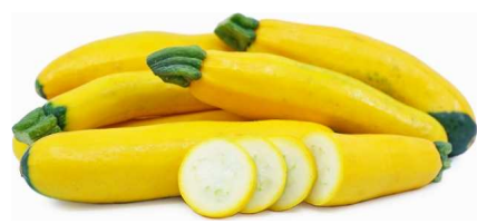
GOLD BAR SQUASH 10 LB