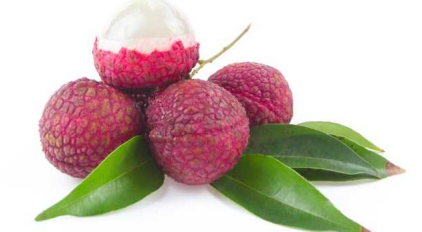
LYCHEE 1 LB