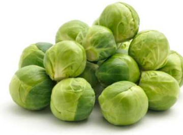
BABY BRUSSEL SPROUTS 12/6 OZ