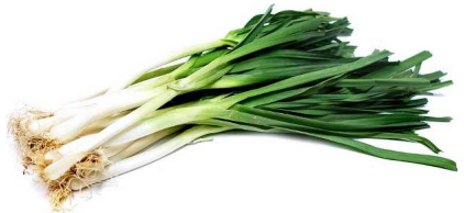
LOCAL GREEN GARLIC 1 LB