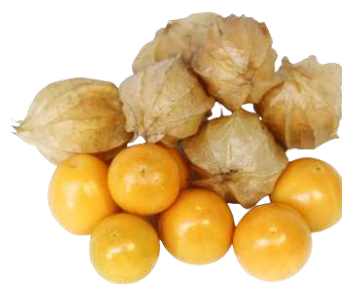
GOOSEBERRIES 8 CT