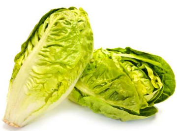
LOCAL NJ ROMAINE LETTUCE 24 CT