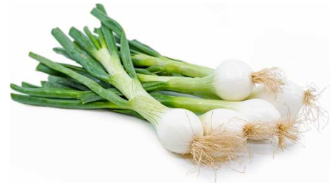
BABY BULB ONION 8 LB