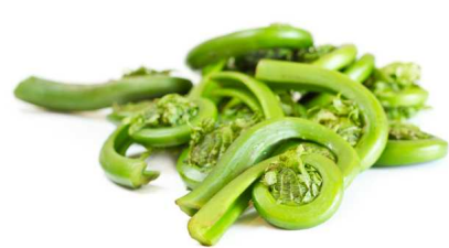
LOCAL FIDDLEHEAD FERNS 1 LB