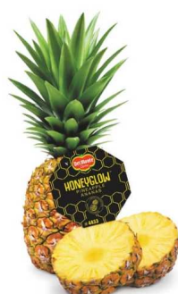
HONEYGLOW PINEAPPLE 6 CT