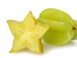
STAR FRUIT 10-15 CT