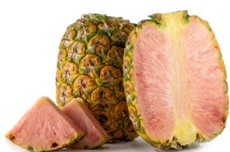
PINK PINEAPPLE 2 CT