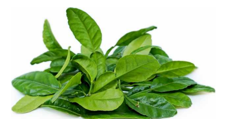
KAFFIR LIME LEAVES 1 LB