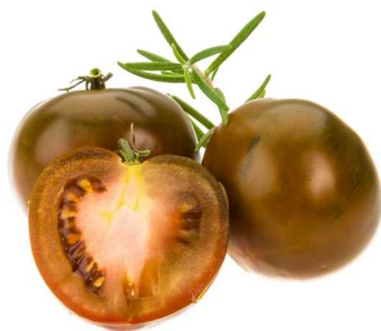
KUMATO TOMATO 10 CT