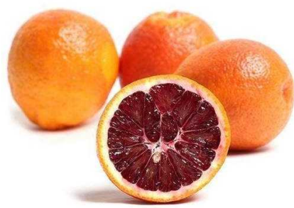
BLOOD ORANGES 18 LB