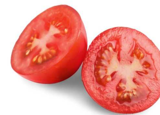
RED AND TASTY TOMATO 2 LAYER 20 LB