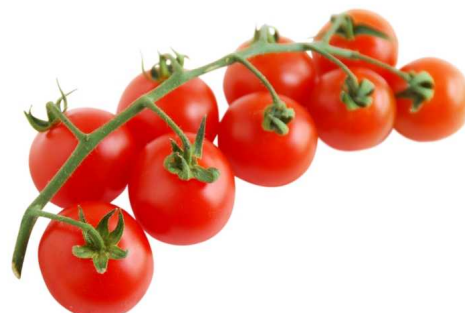
CHERRY TOMATO ON THE VINE