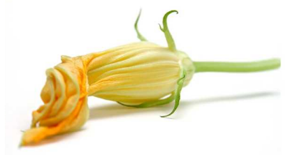
SQUASH BLOSSOM 25 CT / 50 CT