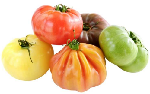
HEIRLOOM TOMATO LARGE MIX 10 LB