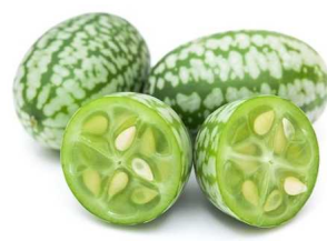
PEPQUINO 50 CT