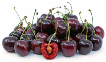
BING CHERRIES 9/10 ROW XL 16 LB

Heirloom, Kumato, Cherry, Grape, Roma, Vine ripe, we have them all!