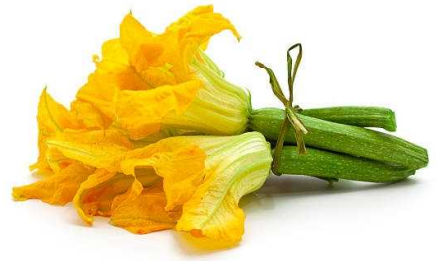
SQUASH BLOSSOM-ZUCCHINI FLOWERS 25 CT / 50 CT