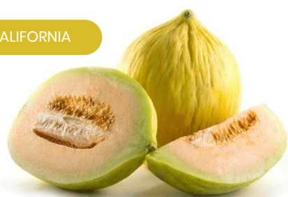
CRENSHAW MELONS 5 CT