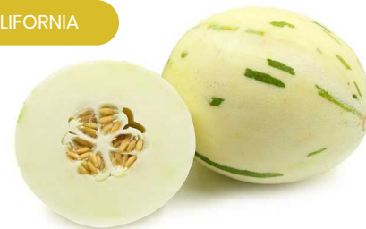
DINO MELONS 6 CT