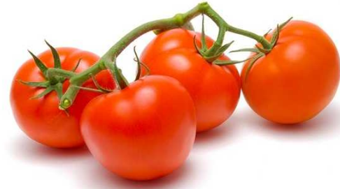
DOUBLE LAYER RED & TASTY 5/6 TOMATO 20 LB