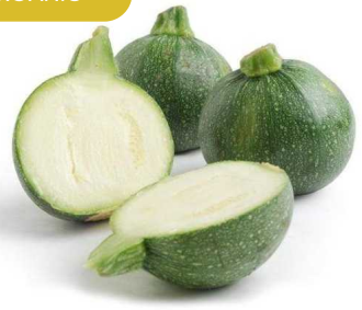
8 BALL/GREEN ROUND SQUASH 20LB