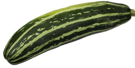
GREEN STRIPED SQUASH 20 LB