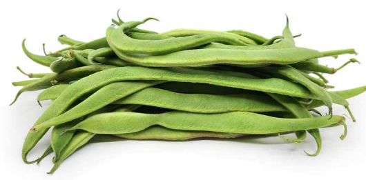
HOLLAND FLAT BEANS 11 LB