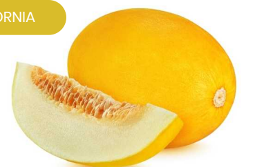
CANARY MELONS 5/6CT