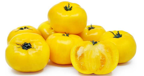
YELLOW BEEFSTEAK TOMATOES 10 LB