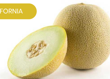
GALIA MELONS 12 CT