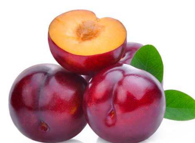
CHERRY PLUMS 28 LB