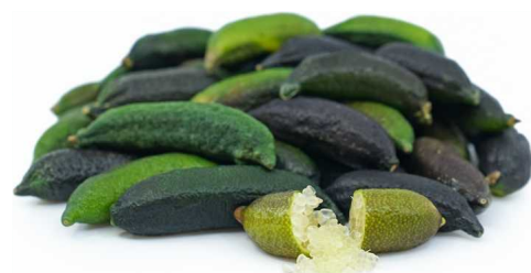
FINGER LIMES 8 OZ