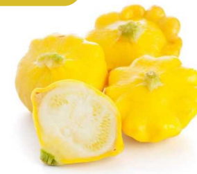
YELLOW PATTY PAN 20 LB