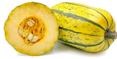
YELLOW STRIPED SQUASH 20 LB