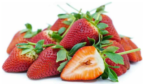
STEMMERIES 8 LB