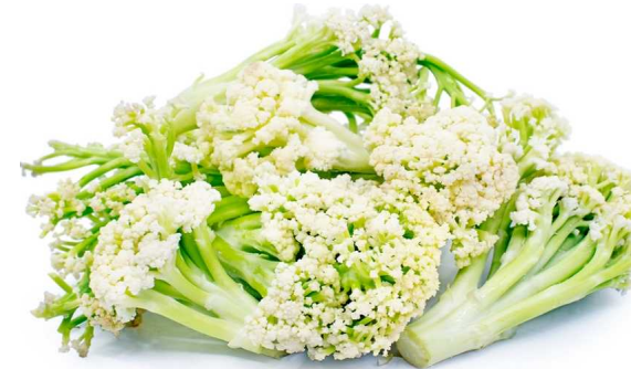
CAULILINI 6 LB