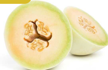
ORANGE FLESH MELONS 5 CT