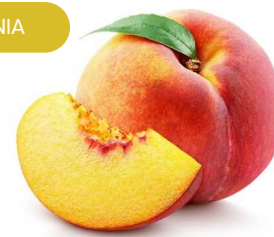
PEACHES TRAY PACK 18 LB