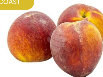
PEACHES SMALL LOOSE 25 LB