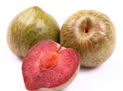
ALLIGATOR PLUOT 28 LB