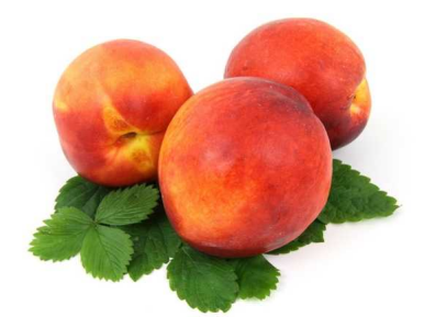
NECTARINES 18 LB