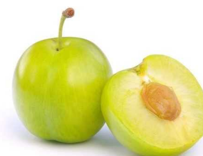
FLAVOR QUEEN PLUOT 108 CT