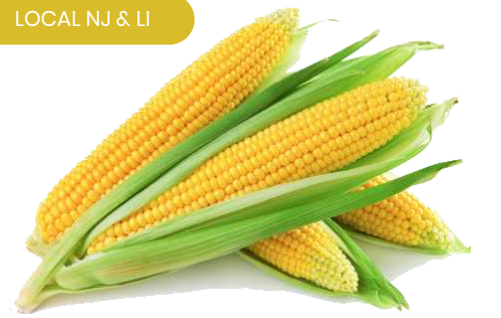
CORN 50 CT