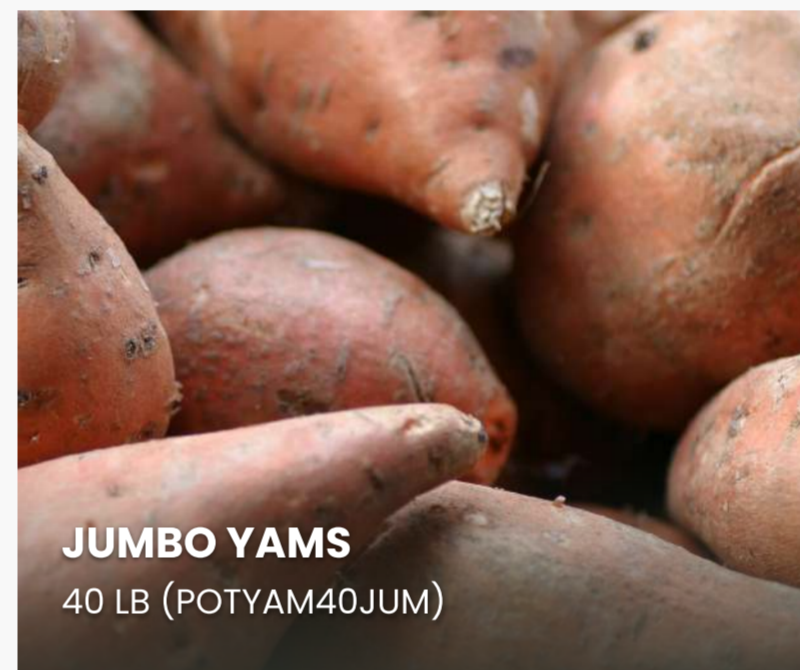
JUMBO YAMS 40 LB (POTYAM40JUM)