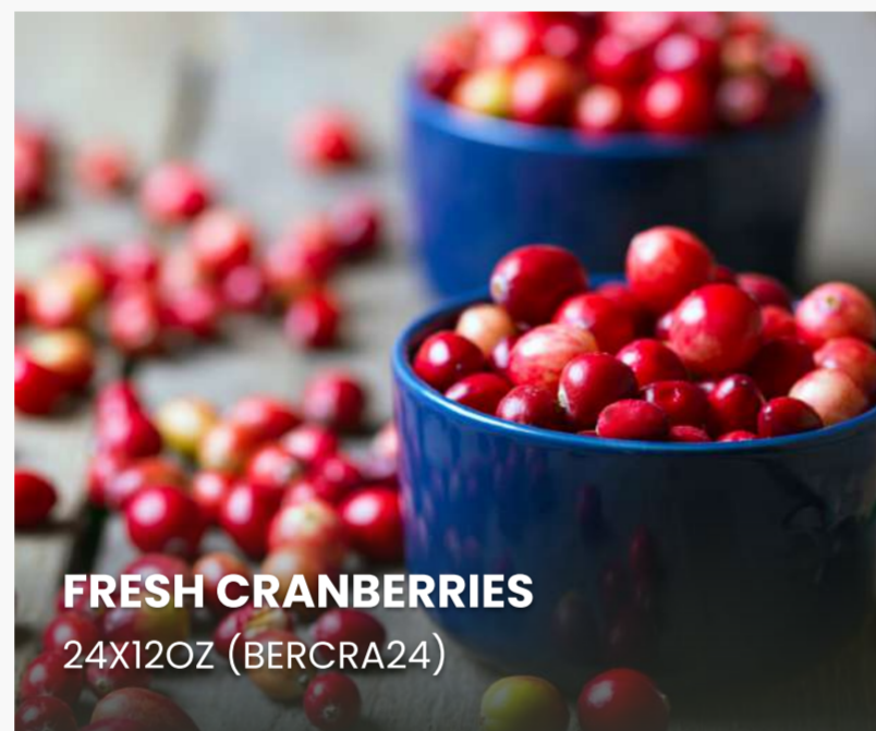
FRESH CRANBERRIES 24X12OZ (BERCRA24)