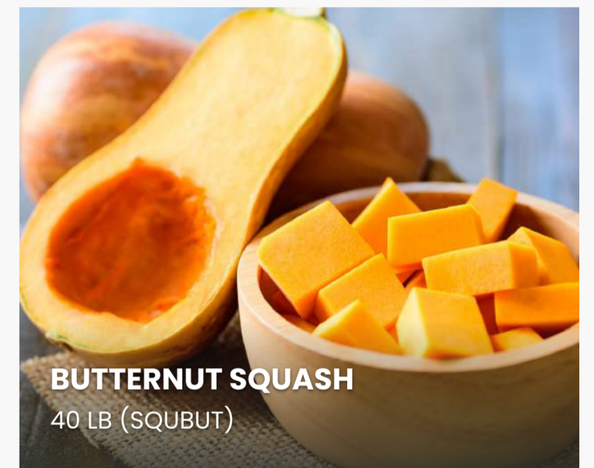
BUTTERNUT SQUASH 40 LB (SQUBUT)