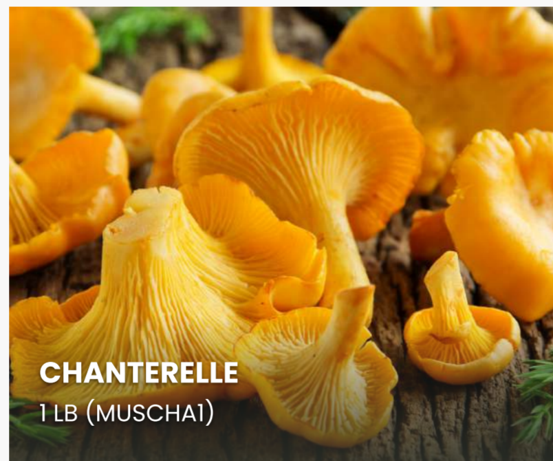
CHANTERELLE 1 LB (MUSCHA1)