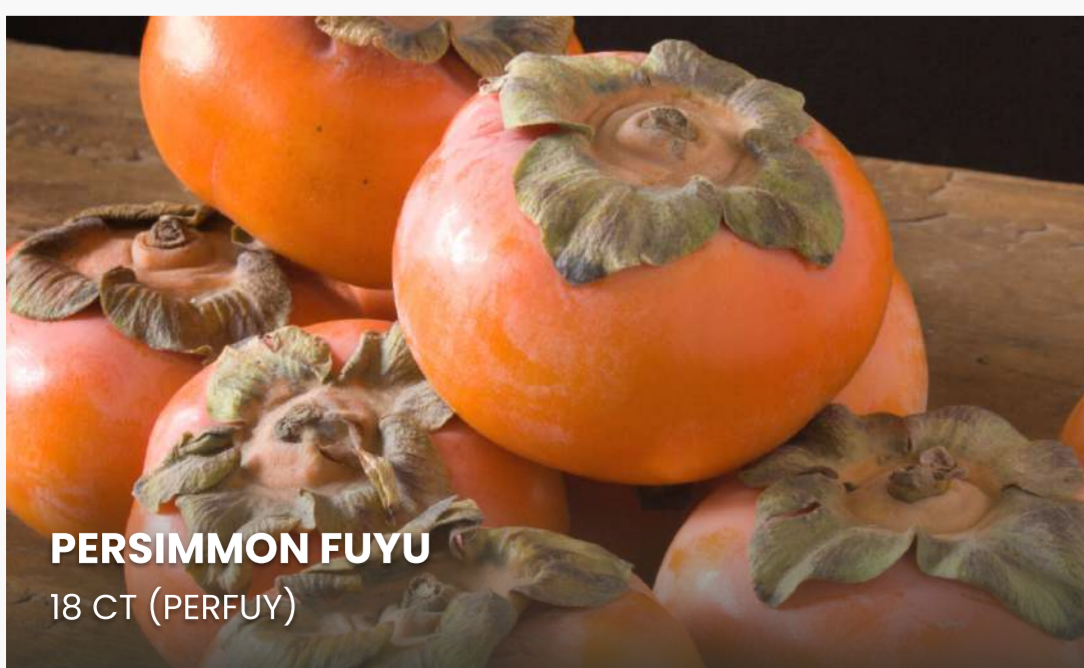
PERSIMMON FUYU 18 CT (PERFUY)