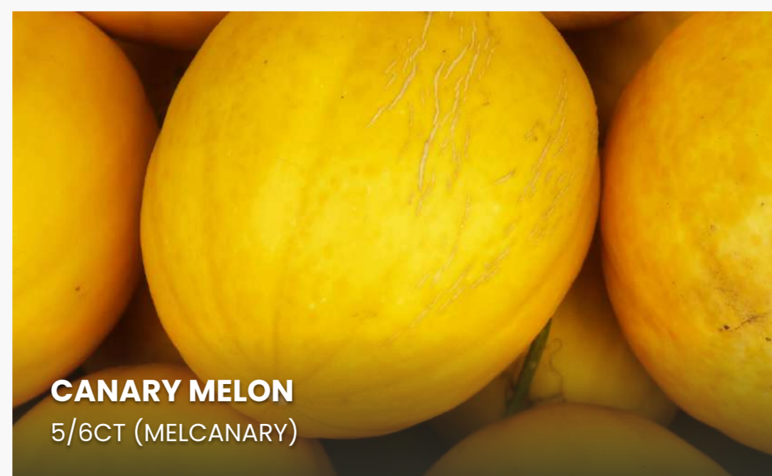
CANARY MELON 5/6CT (MELCANARY)