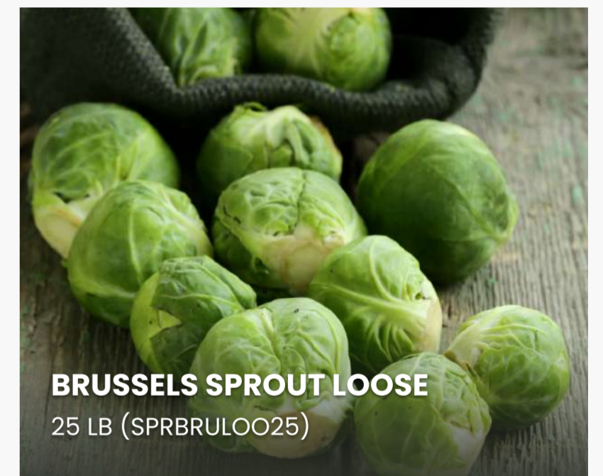
BRUSSELS SPROUT LOOSE 25 LB (SPRBRULOO25)