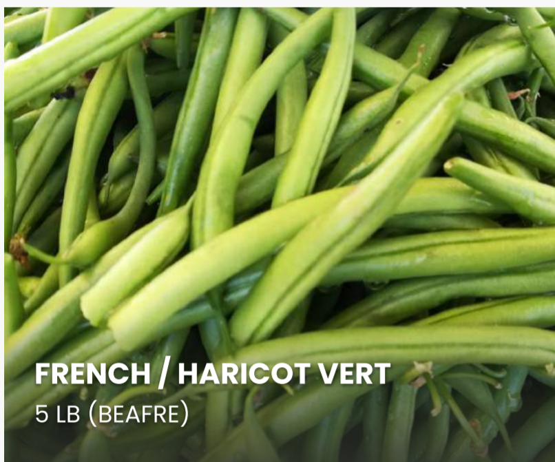
FRENCH / HARICOT VERT 5 LB (BEAFRE)