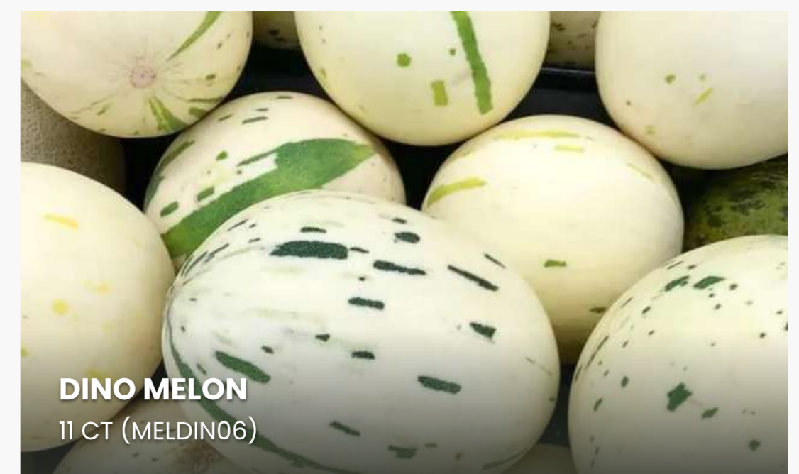
DINO MELON 11 CT (MELDIN06)