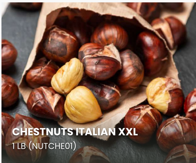
CHESTNUTS ITALIAN XXL 1 LB (NUTCHE01)