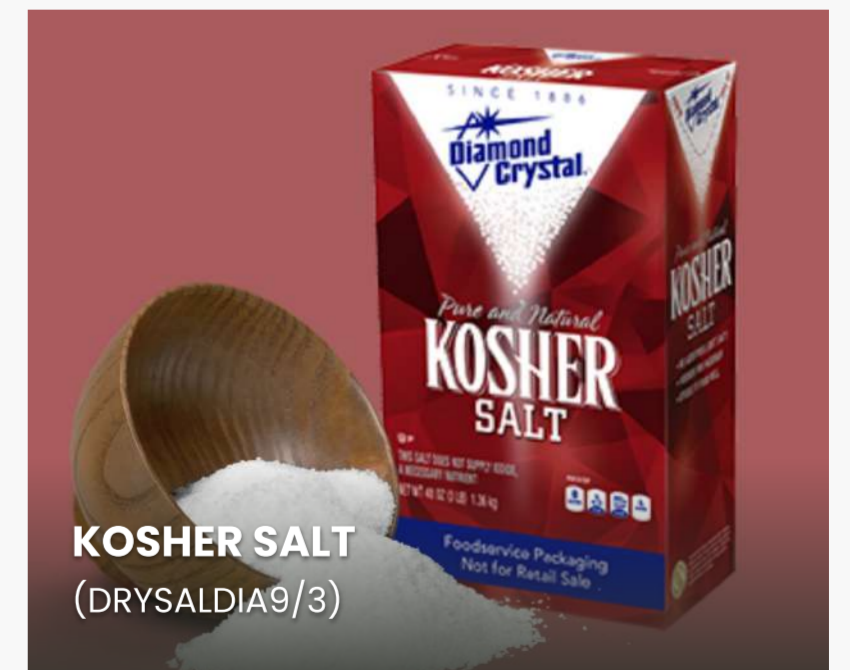
KOSHER SALT (DRYSALDIA9/3)