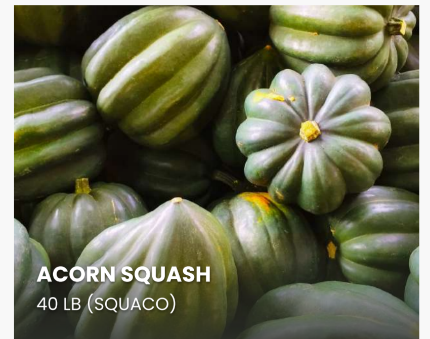
ACORN SQUASH 40 LB (SQUACO)