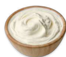
MASCARPONE 1 LB (DAICHEMASILB)