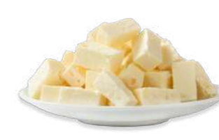
FETA CHEESE 8 LB (DAICHEFET)