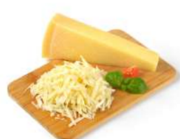
PARMESAN GRATED 5 LB (DAICHEPECGRA)