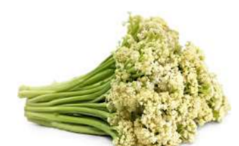
FLORENTINO CAULIFLOWER 18 CT (CAUFLOCS)