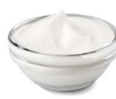
HEAVY CREAM 40% 1 QT (DAIMILCREHEA)