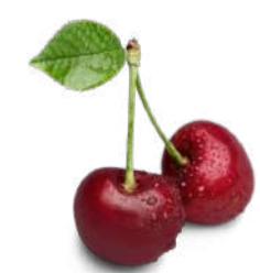
CHERRIES 16 LB (CHE8/2)