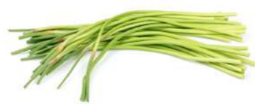
GARLIC SCAPES 1 LB (GARSCA)