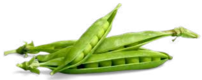
ENGLISH PEAS 10 LB (PEAENG10)