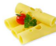
SWISS CHEESE SLICED 10 LB ( DAICHESWISLI)