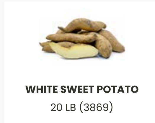
WHITE SWEET POTATO 20 LB (3869)