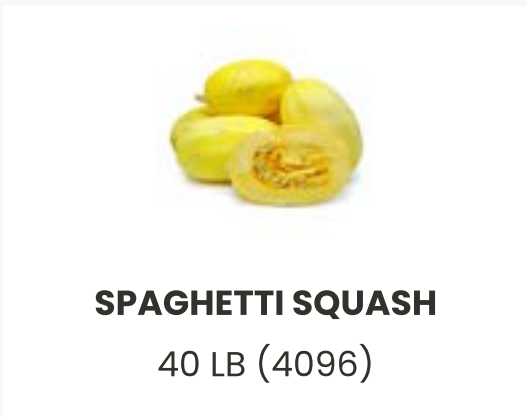
SPAGHETTI SQUASH 40 LB (4096)