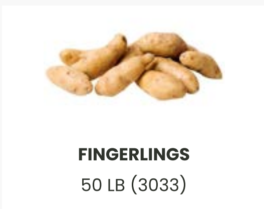
FINGERLINGS 50 LB (3033)