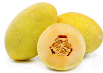
GOLDEN HAMI MELON 6 CT (0348)