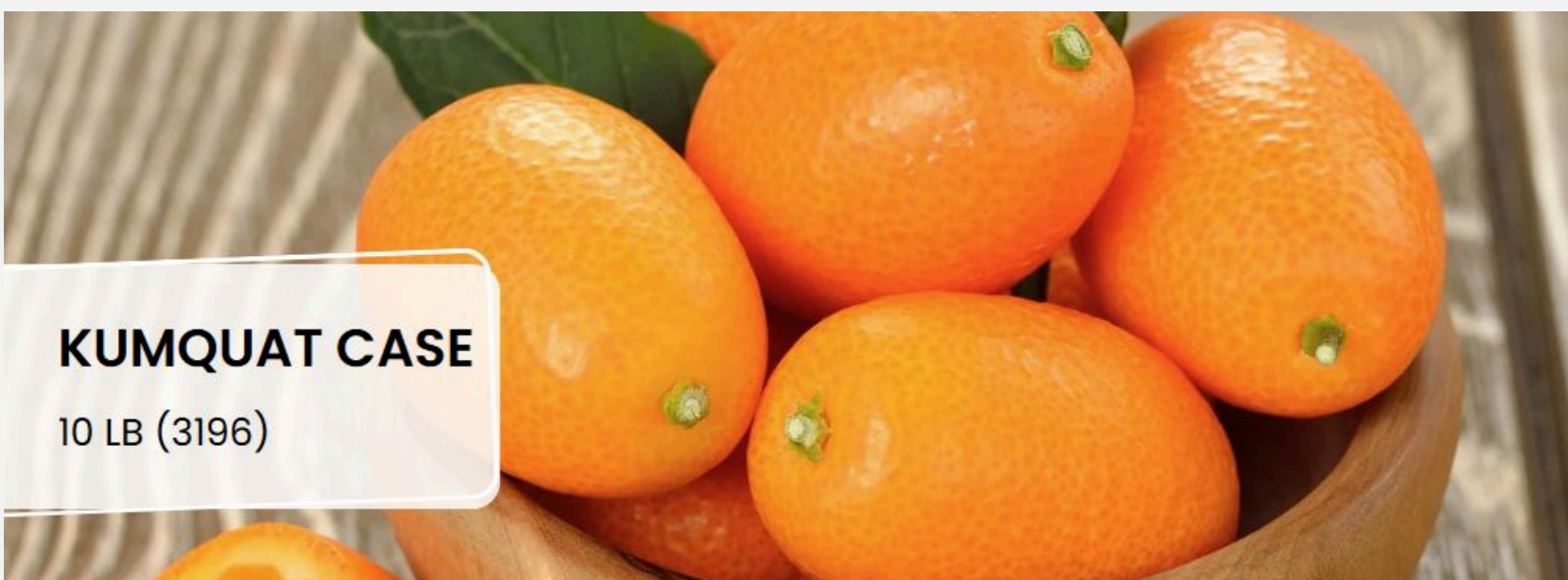
KUMQUAT CASE 10 LB (3196)