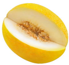
CANARA MELON 6 CT (3323)