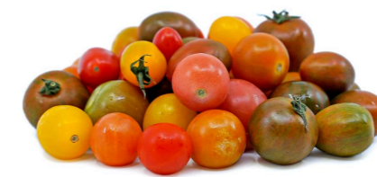
TOMATO TRI COLOR ON THE VINE 12/6 OZ (5545)