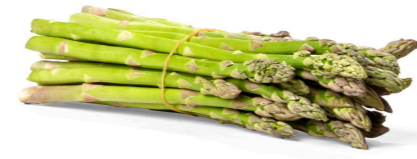
JUMBO ASPARAGUS 11 LB (2597)