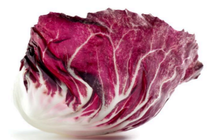
CASTELFRANCO RADICCHIO 9 CT (713)