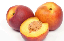
NECTARINES 18 LB