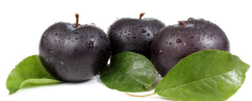
BLACK PLUMS 28 LB (3810)