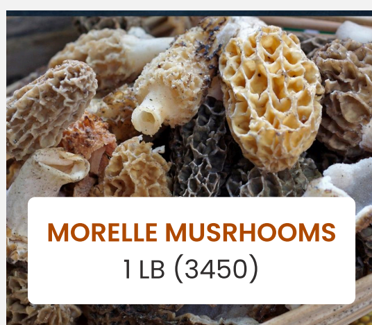
MORELLE MUSHROOMS 1 LB (3450)