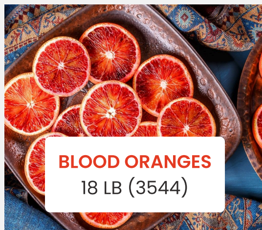
BLOOD ORANGES 18 LB (3544)