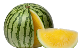
YELLOW WATERMELON EA (3329)