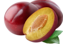
RED PLUMS 28 LB (3812)