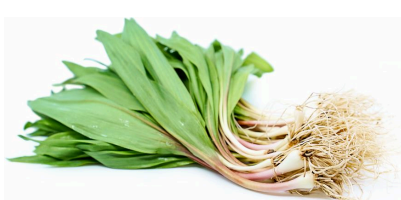
LEEK RAMPS NYS 1 LB (3222)