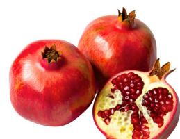
POMEGRANATE PERU 5/8 SZ (3820)