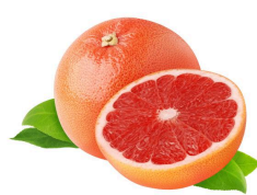
RUBY RED GRAPEFRUIT 23/27 SZ (3123)