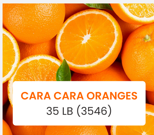
CARA CARA ORANGES 35 LB (3546)