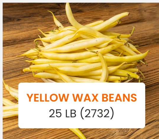
YELLOW WAX BEANS 25 LB (2732)