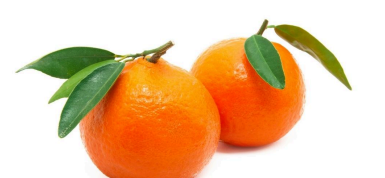
MANDARINS STEM & LEAF 20 LB (5353)