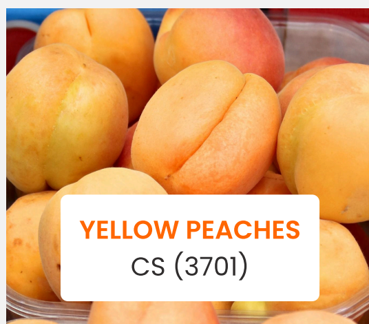
YELLOW PEACHES CS (3701)