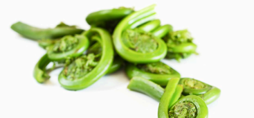
FIDDLEHEAD FERNS 1 LB (3039)