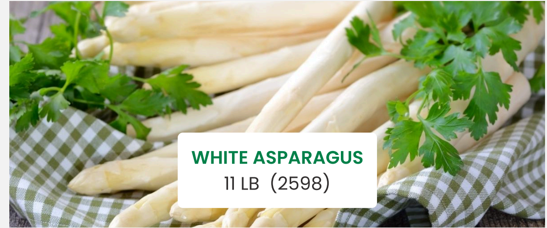
WHITE ASPARAGUS 11 LB (2598)