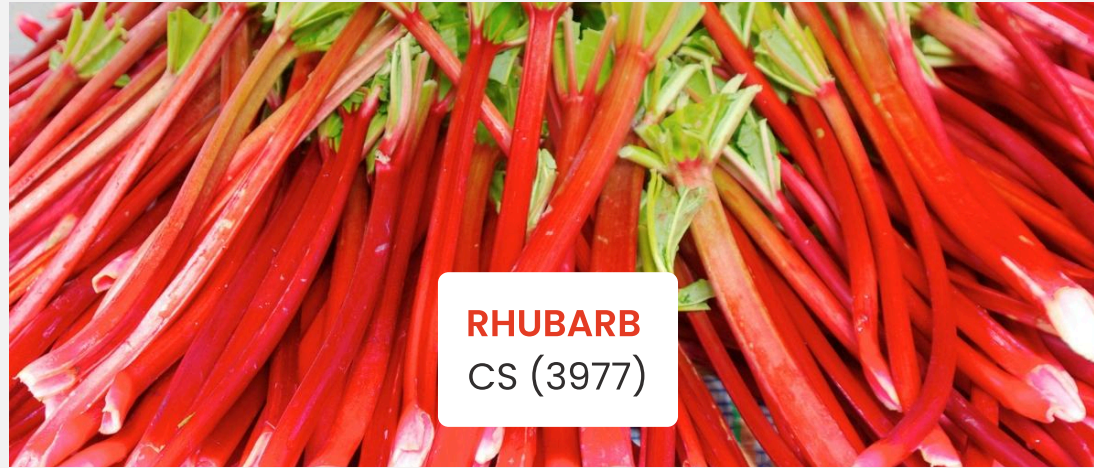
RHUBARB CS (3977)