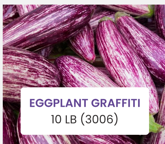
EGGPLANT GRAFFITI 10 LB (3006)