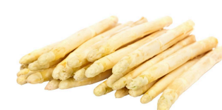
WHITE HOLLAND XL ASPARAGUS 11 LB (2599)