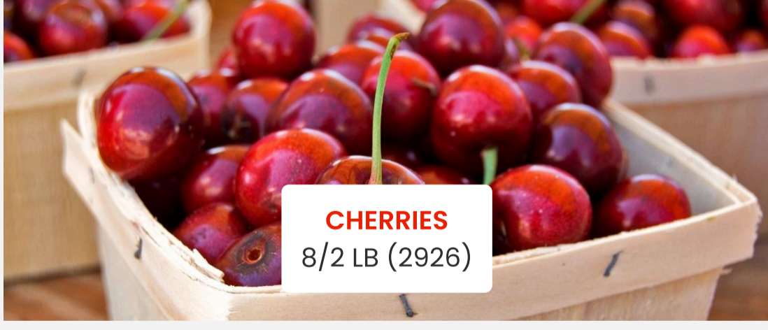
CHERRIES 8/2 LB (2926)