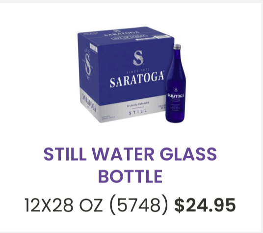
STILL WATER GLASS BOTTLE 12X28 OZ (5748) $24.95