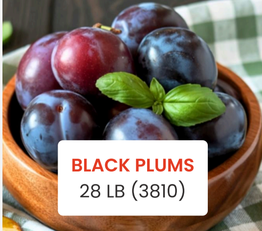
BLACK PLUMS 28 LB (3810)