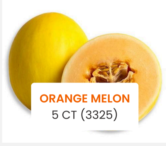
ORANGE MELON 5 CT (3325)