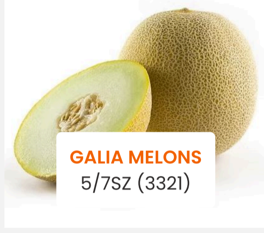
GALIA MELONS 5/7SZ (3321)