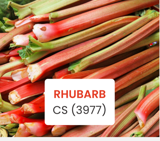
RHUBARB CS (3977)