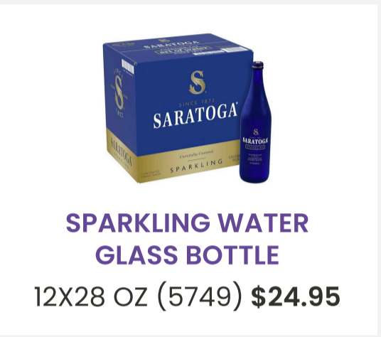
SPARKLING WATER GLASS BOTTLE 12X28 OZ (5749) $24.95