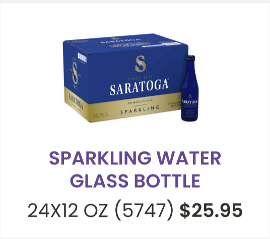
SPARKLING WATER GLASS BOTTLE 24X12 OZ (5747) $25.95