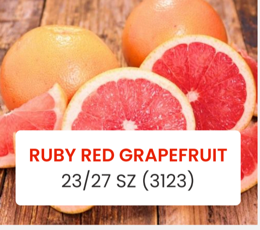
RUBY RED GRAPEFRUIT 23/27 SZ (3123)