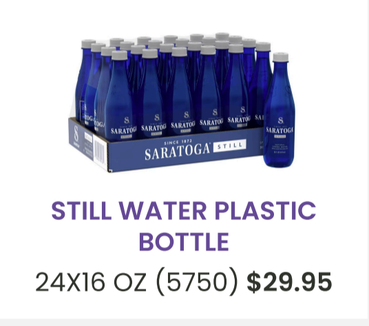
STILL WATER PLASTIC BOTTLE 24X16 OZ (5750) $29.95