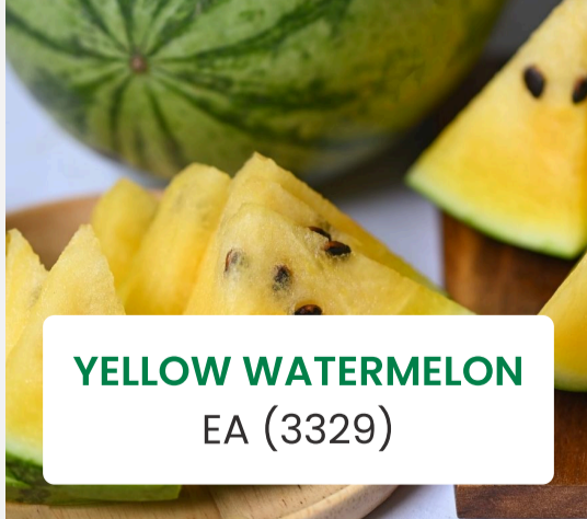
YELLOW WATERMELON EA (3329)