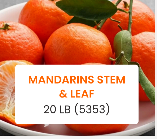
MANDARINS STEM & LEAF 20 LB (5353)