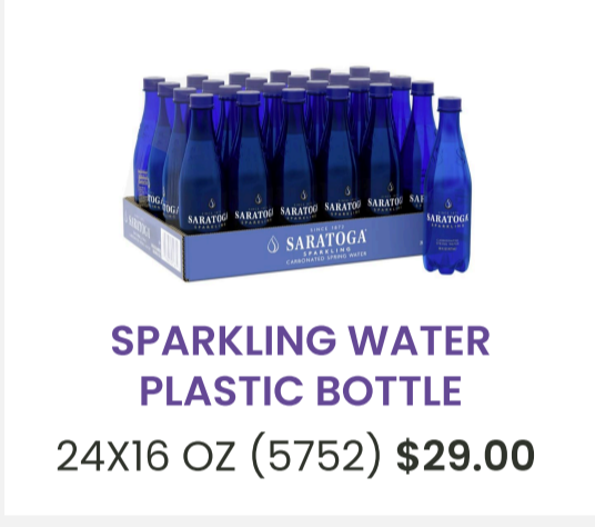
SPARKLING WATER PLASTIC BOTTLE 24X16 OZ (5752) $29.00