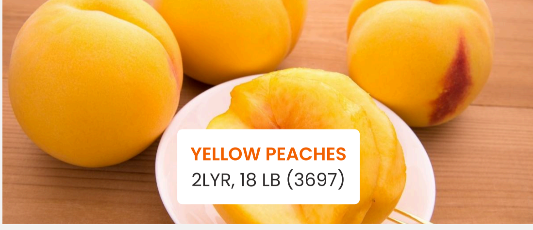
YELLOW PEACHES 2LYR, 18 LB (3697)