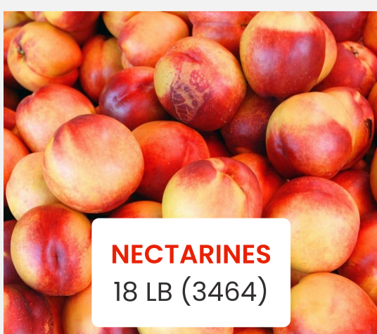
NECTARINES 18 LB (3464)