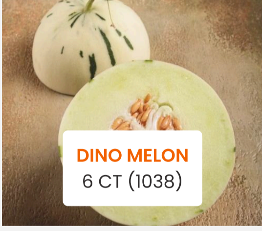
DINO MELON 6 CT (1038)