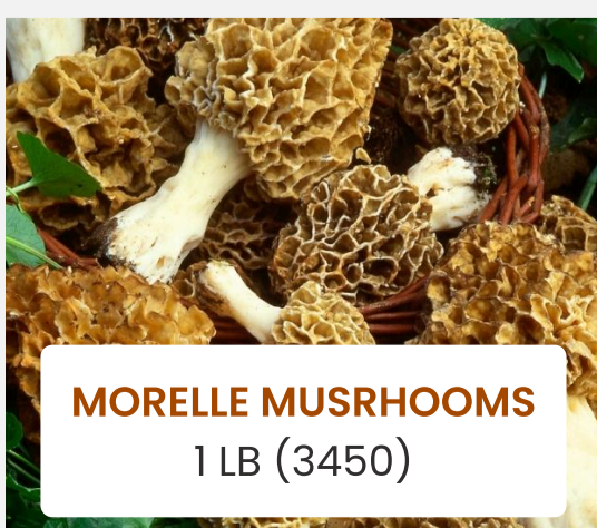
MORELLE MUSHROOMS 1 LB (3450)