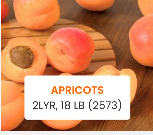
APRICOTS 2LYR, 18 LB (2573)