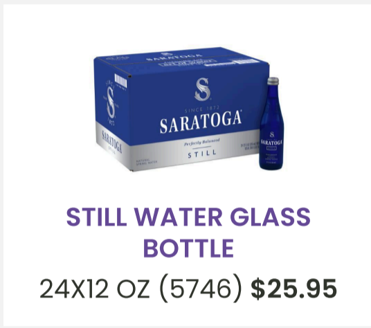
STILL WATER GLASS BOTTLE 24X12 OZ (5746) $25.95