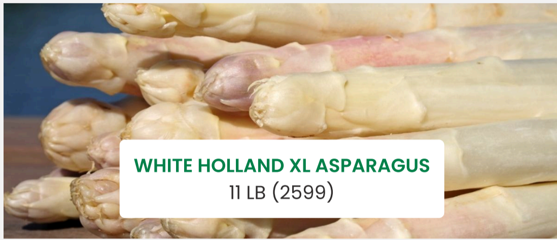
WHITE HOLLAND XL ASPARAGUS 11 LB (2599)

Follow us on social media for the latest updates, @Riviera_Produce.